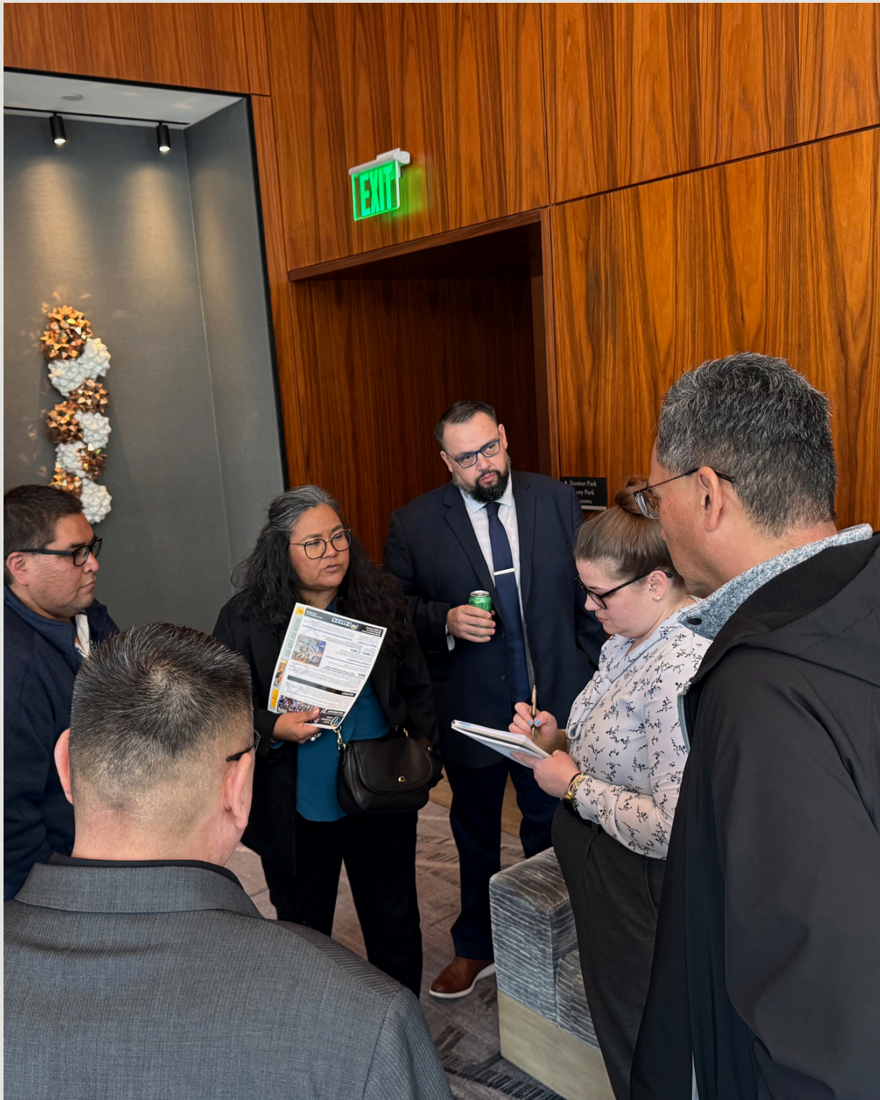
TIBC March 2025